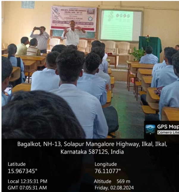
Bagalkot, NH-13, Solapur Mangalore Highway, Ilkal, Ilkal, Karnataka 587125, India

Latitude 15.967345° Longitude 76.11077° Local 12:35:31 PM Altitude 569 m GMT 07:05:31 AM Friday, 02.08.2024