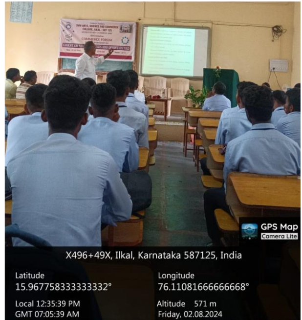
X496+49X, Ilkal, Karnataka 587125, India

Latitude 15.967345° Longitude 76.11077° Local 12:35:31 PM Altitude 569 m GMT 07:05:31 AM Friday, 02.08.2024