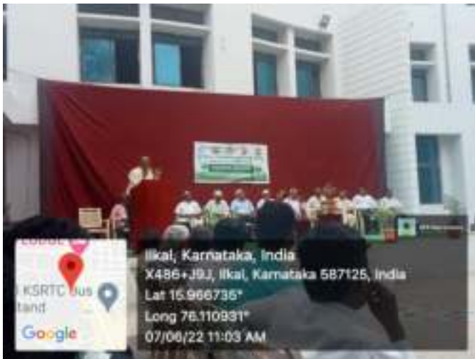
Photo Gallery of the Programme