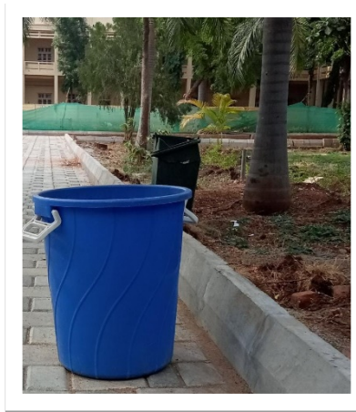
WASTE COLLECTION BINS ARE PLACED IN THE CAMPUS FOR COLLECTION OF SOLID WASTE