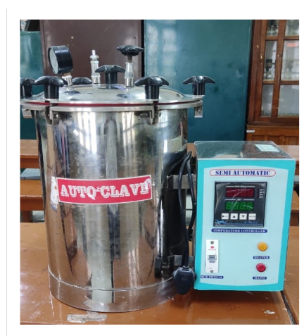
MICROBIAL CULTURES WASTE OF ZOOLOGY LABORATORY ARE AUTOCLAVED AND DISPOSED