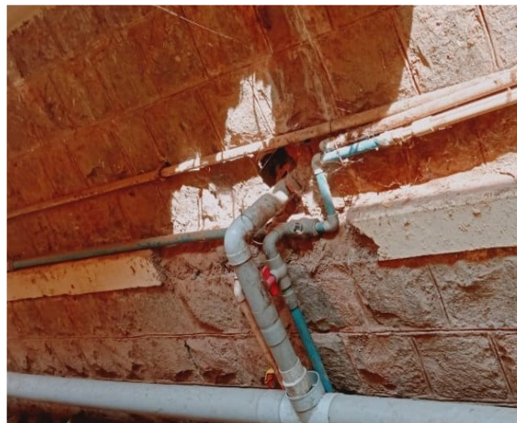
PIPELINE CONECTION TO DRINAGE TO MANGAE LIQUID CHEMICAL WASTE