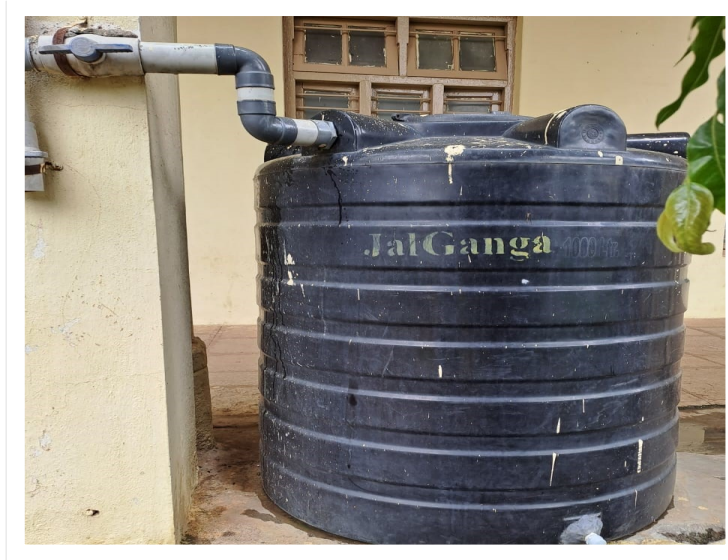
RAIN WATER COLLECTION TANK