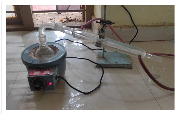
USE OF DISTILLATION UNIT IN THE DEPT. OF CHEMISTRY

Organic Solvents are purified by the distillation method and reused in the Chemistry laboratory. Solid like Derivatives of acetanilide, phthalimide etc., are recrystallised and used for the qualitative analysis. Rain water unit is established for the collection of rain water directly and it is used for the laboratory reagent preparation and performing experiments.