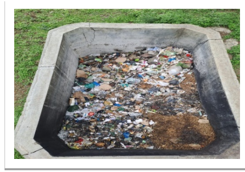
SOLID WASTE COLLECTION PIT