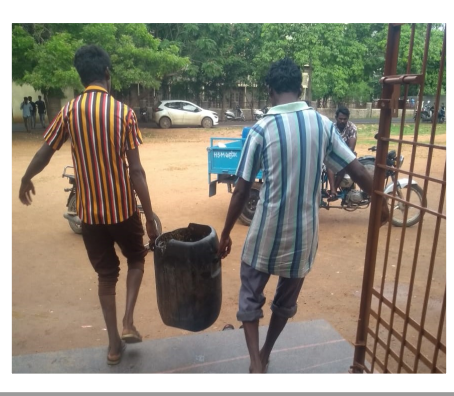
KITCHEN WASTE AND EXCESS FOOD WASTE COLLECTED AND ITS DONATED TO THE NEEDY